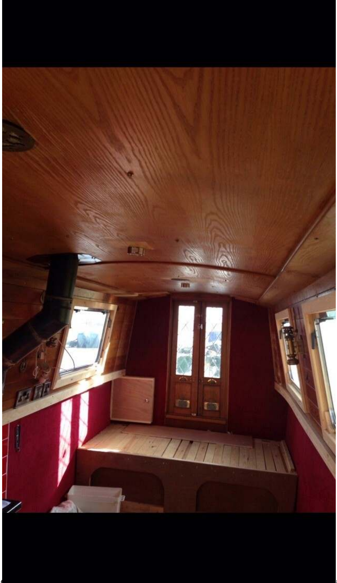
Page 7 of Last updated 17 June 2015